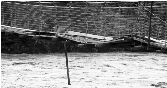
Damage to the foot bridge at Gitwinksihlkw

There was some damage caused by all this water.